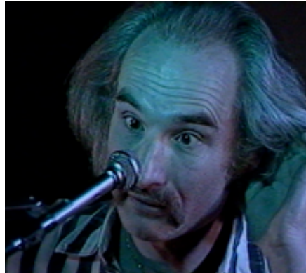
Holger Czukay, 1982