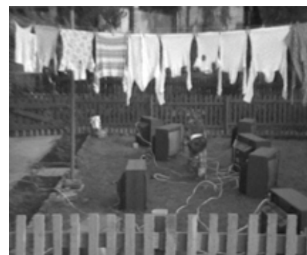
HA Schult, 1978