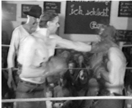
Beuys Boxkampf, Kassel 1972