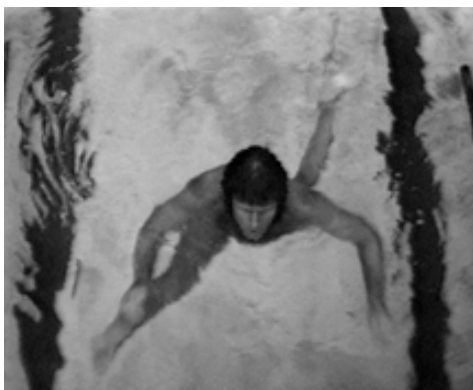
Klaus Rinke, 1971